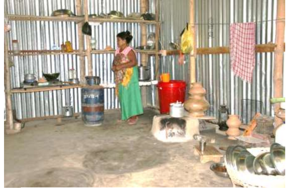
Kitchen SCH Thongjao