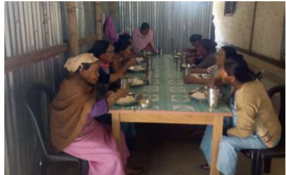
Inmates having lunch at Dining hall SCH Thongjao