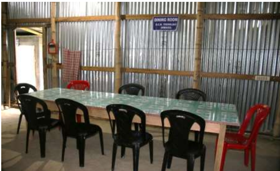
Dining hall SCH Jiribam