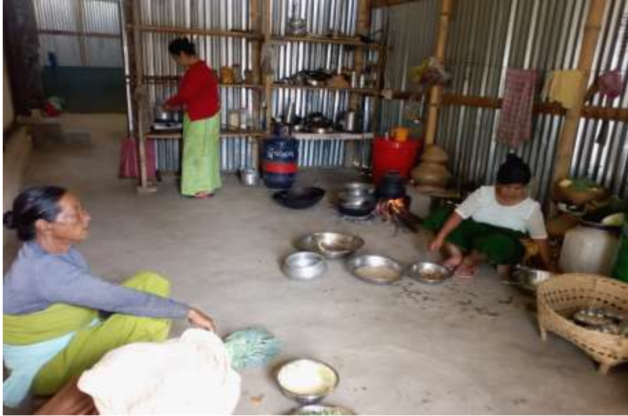
Kitchen SCH Thongjao