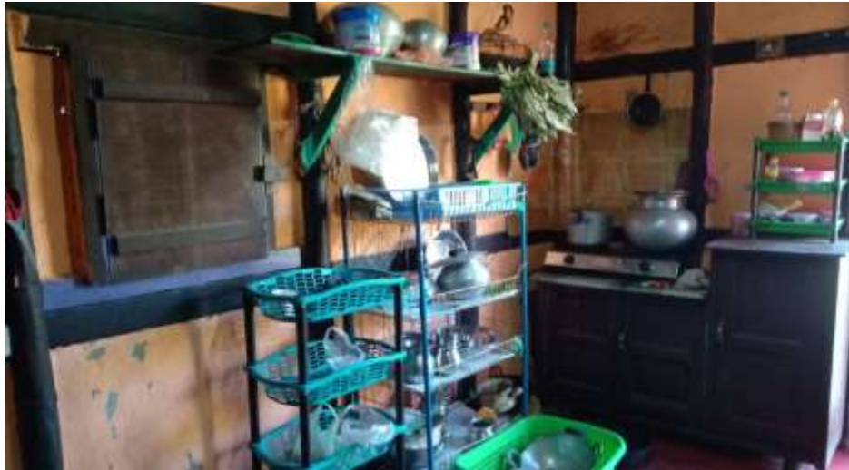
Kitchen SCH Ngaikhong Khullen