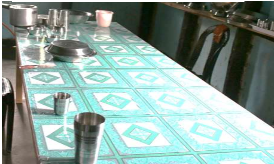
Dining hall SCH Ngaikhong Khullen