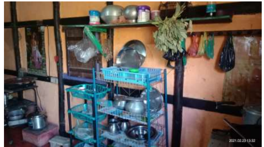
Kitchen SCH Ngaikhong Khullen