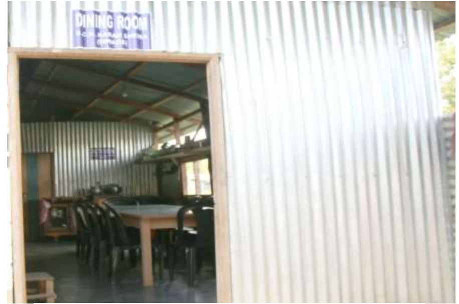
Kitchen SCH Naranseina