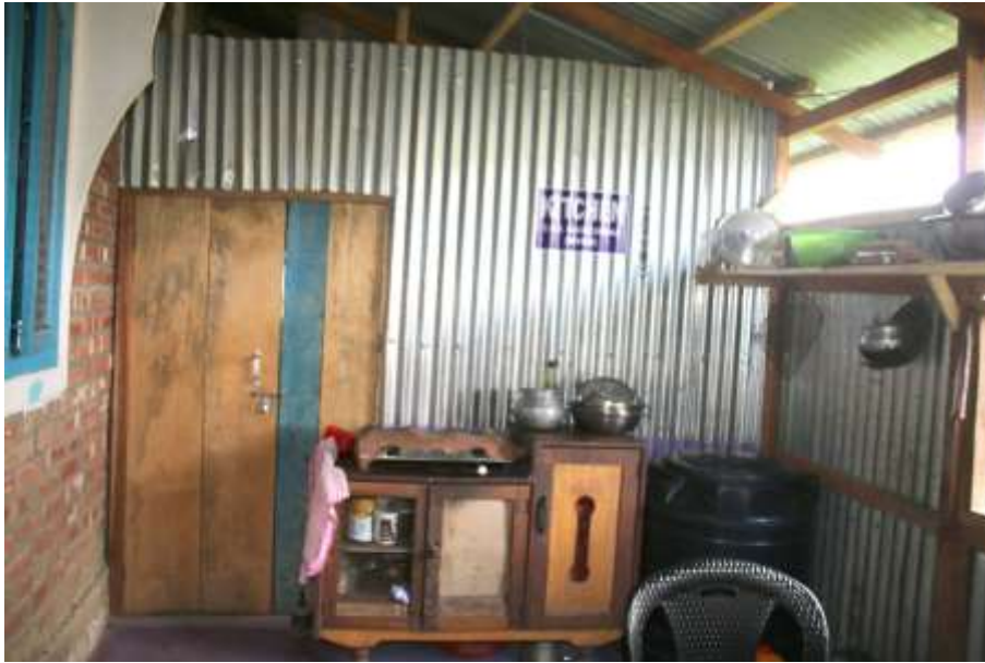
Kitchen SCH Naranseina