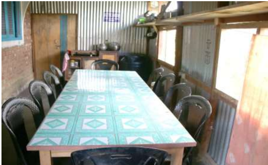
Dining hall SCH Naranseina